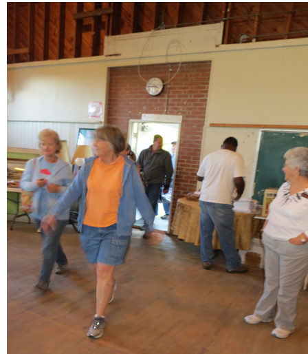
Digging for Treasure at Annual Yard Sale