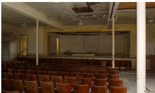
Auditorium with view of stage