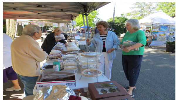
Annual Bake Sale